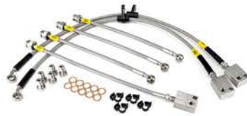
HEL braided brake lines Part No. HON-6-136