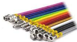
HEL flexible braided clutch line Part No. CCK143